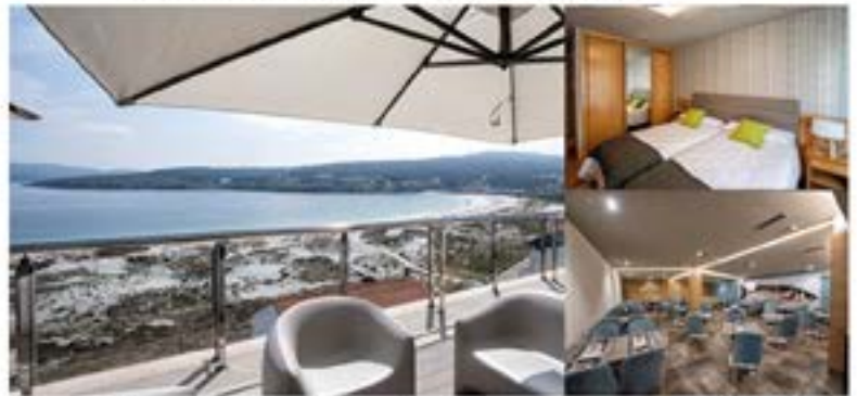
Hotel VIDA Finisterre Centro **