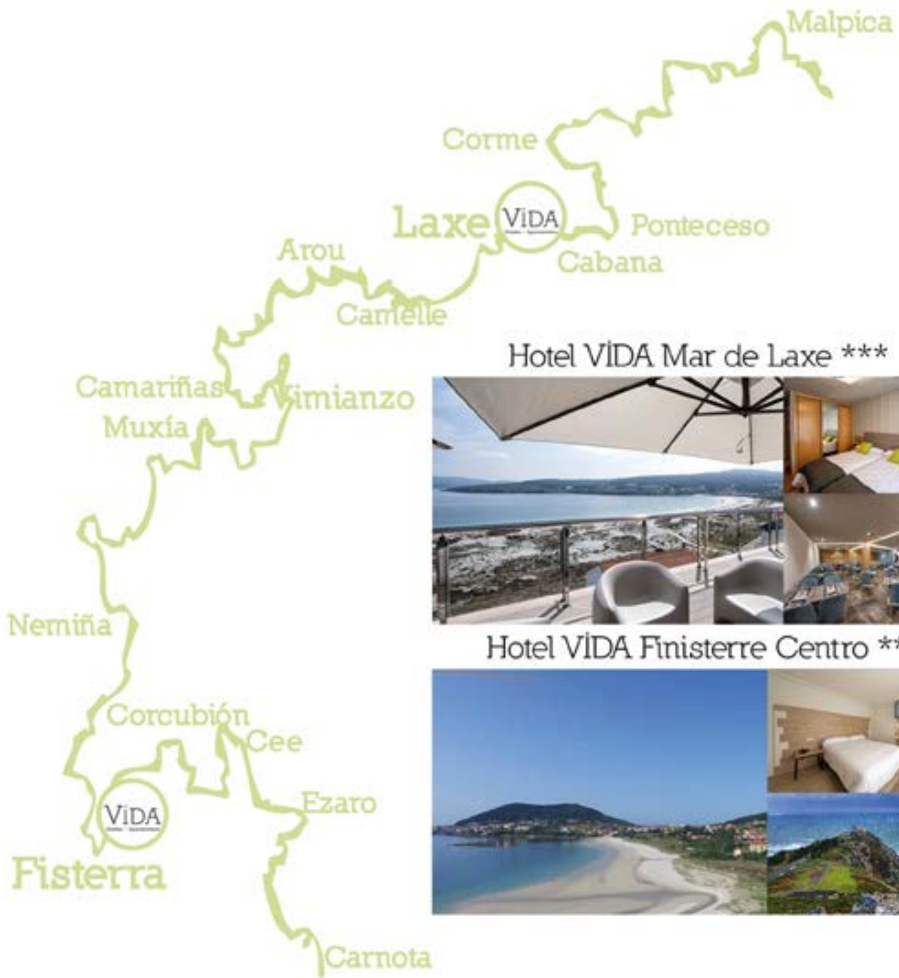
Hotel VIDA Mar de Laxe ***